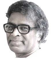
Anthony De Mello Indian Jesuit priest

Give me that which enabled you to give it to me."